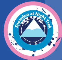
August 3 - 4