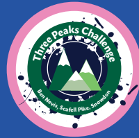
May 17 - 19 September 6 - 8