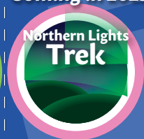
March 5 - 9