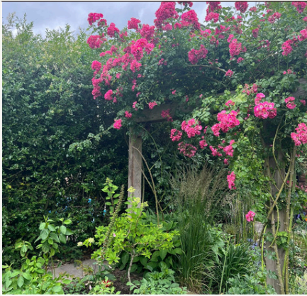
Lymm Open Gardens 21st June

Take a look at what is coming up this year: