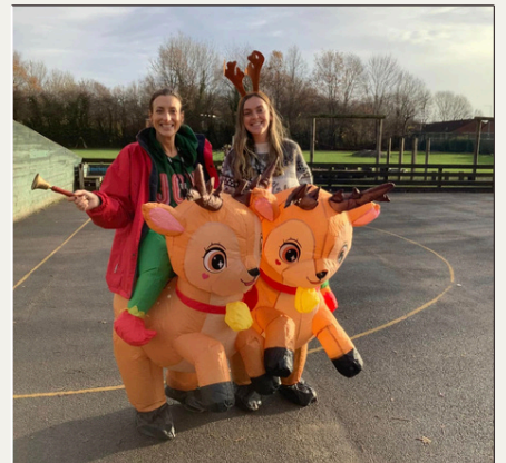
Elf and Reindeer Run Throughout December