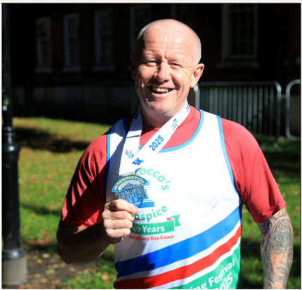
Warrington Running Festival 20th September