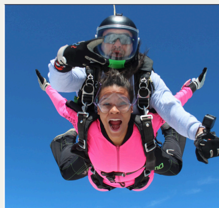
Challenge Events All year round