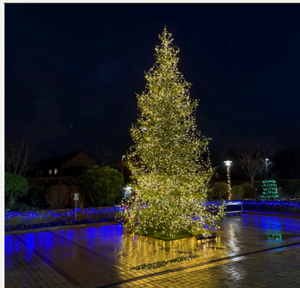
Christmas markets and Light up a life 6th December