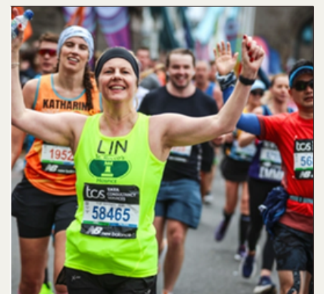
Running Events All year round