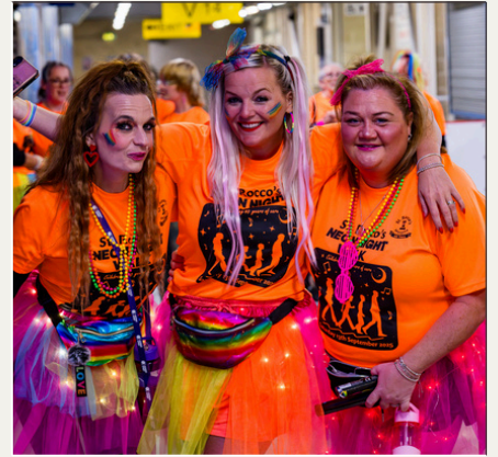
Neon Night Walk 5th September