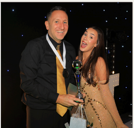
Strictly St Rocco's 13th December