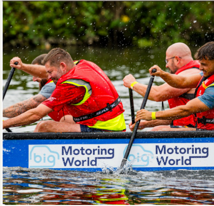
Dragon Boat 26th July